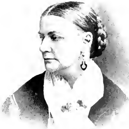
EMMA D. E. N. SOUTHWORTH.